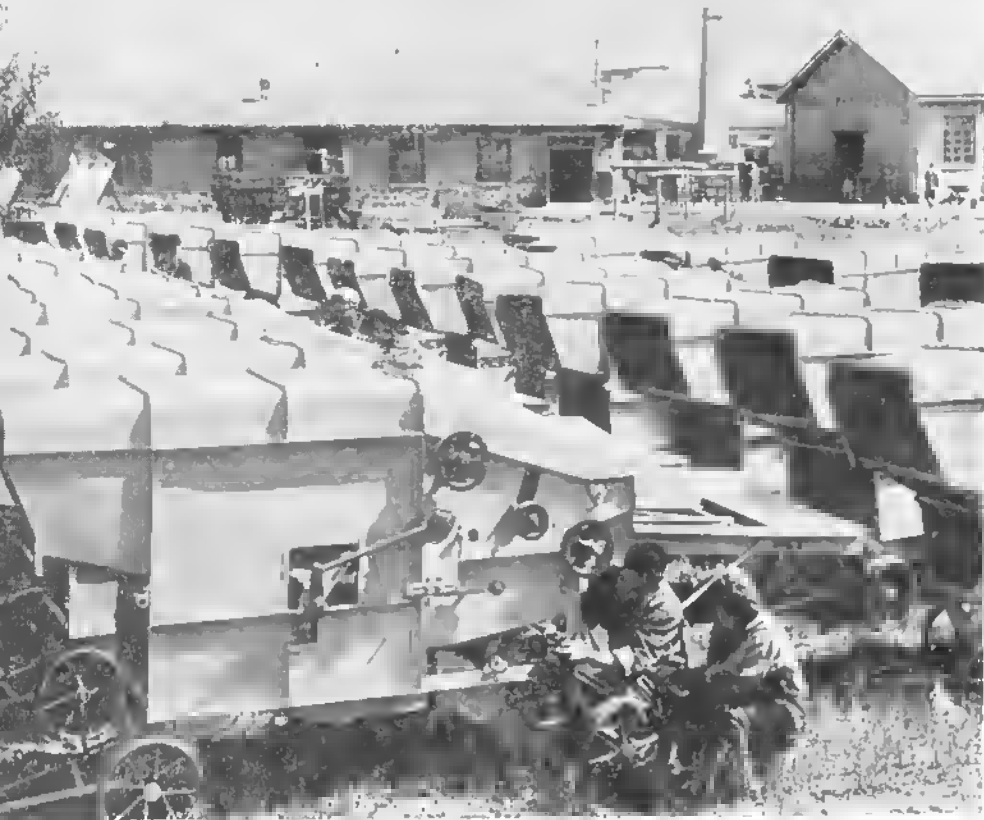
Final check of threshers — Changpei County Farm Implement Works in Hebei province.